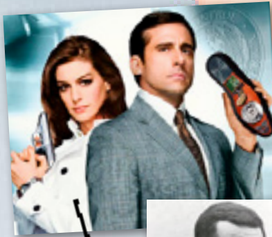
Anne Hathaway and Steve Carell stepped into the iconic roles created by Barbara and Don Adams (below) for the 2008 Get Smart film.