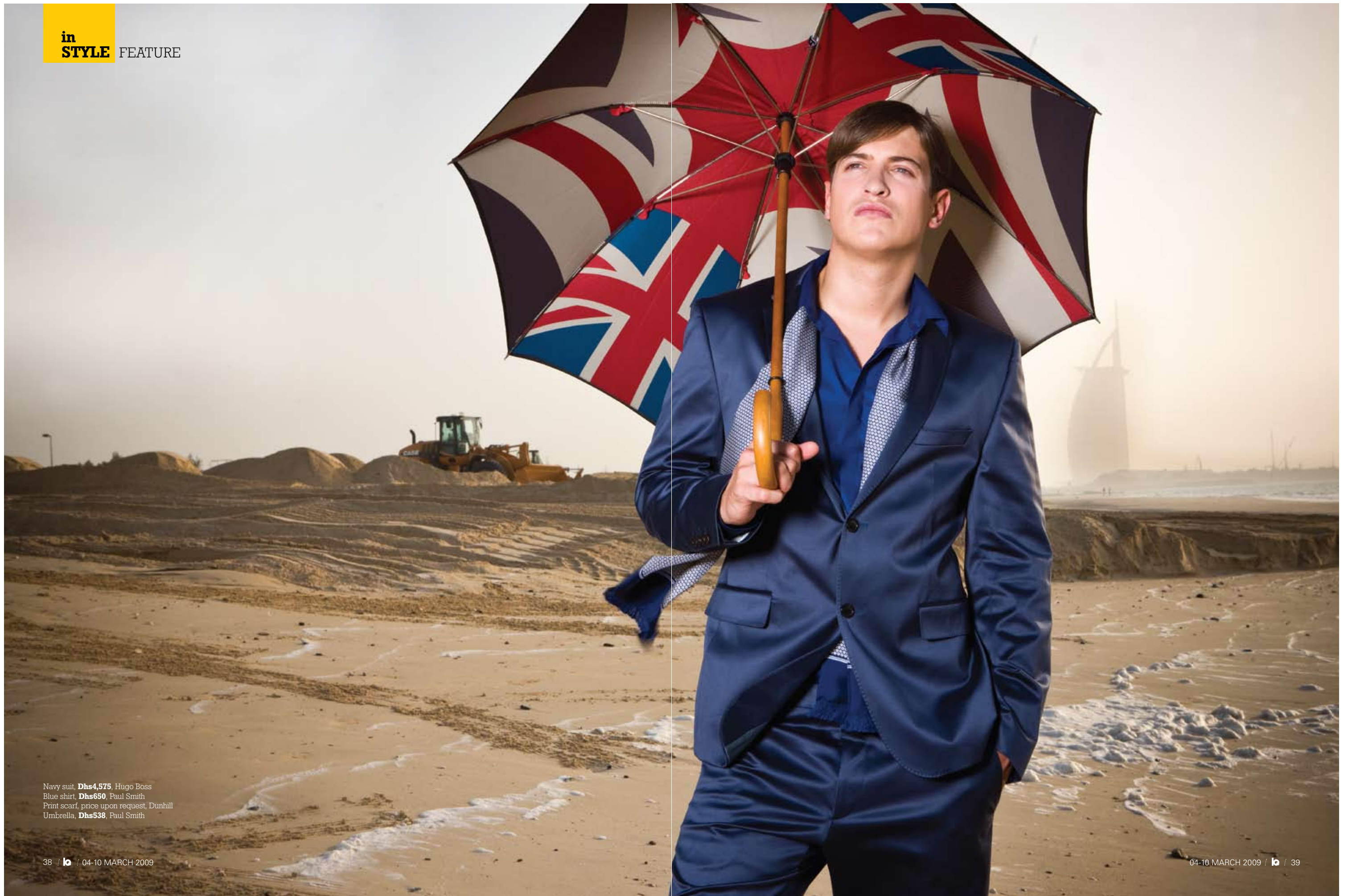
Navy suit, Dhs4,575 , Hugo Boss Blue shirt, Dhs650 , Paul Smith Print scarf, price upon request, Dunhill Umbrella, Dhs538 , Paul Smith