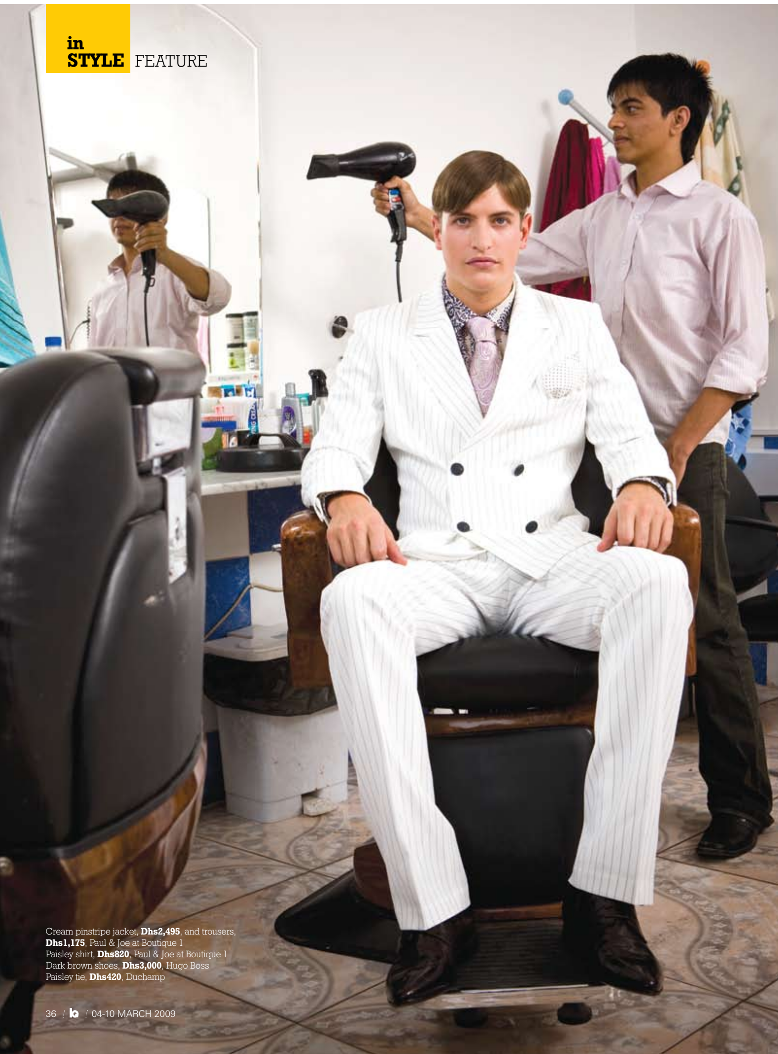
Cream pinstripe jacket, Dhs2,495 , and trousers, Dhs1,175 , Paul & Joe at Boutique 1 Paisley shirt, Dhs820 , Paul & Joe at Boutique 1 Dark brown shoes, Dhs3,000 , Hugo Boss Paisley tie, Dhs420 , Duchamp