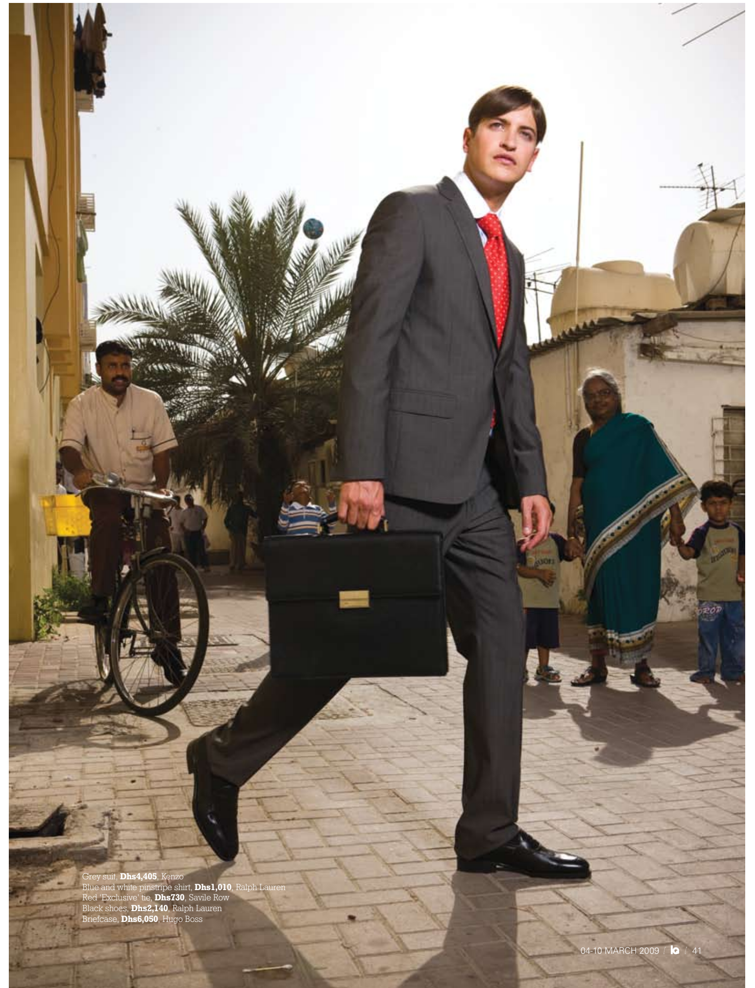
Grey suit, Dhs4,405 , Kenzo Blue and white pinstripe shirt, Dhs1,010 , Ralph Lauren Red 'Exclusive' tie, Dhs730 , Savile Row Black shoes, Dhs2,140 , Ralph Lauren Briefcase, Dhs6,050 , Hugo Boss