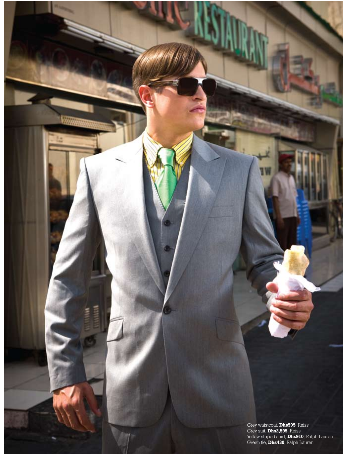
Grey waistcoat, Dhs595 , Reiss Grey suit, Dhs2,595 , Reiss Yellow striped shirt, Dhs910 , Ralph Lauren Green tie, Dhs430 , Ralph Lauren