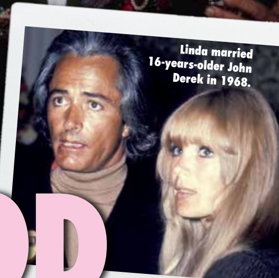
Linda married 16-years-older John Derek in 1968.